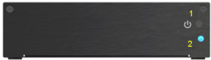
Front I/O Port