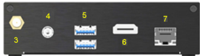
Rear I/O Port