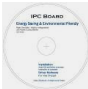
CD (HW Driver)