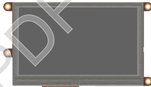
The uLCD-43DT Display Module