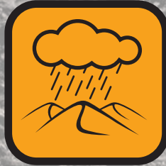
IP 65 Certified