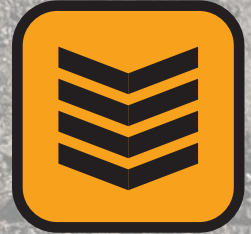
Military grade quality