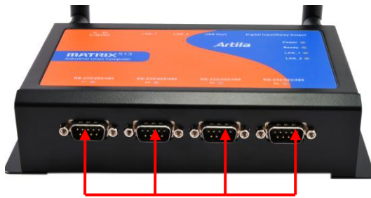
RS-232/422/485, select by software