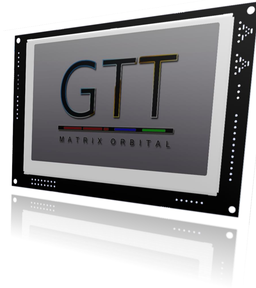
Figure 1: The GTT50A Display